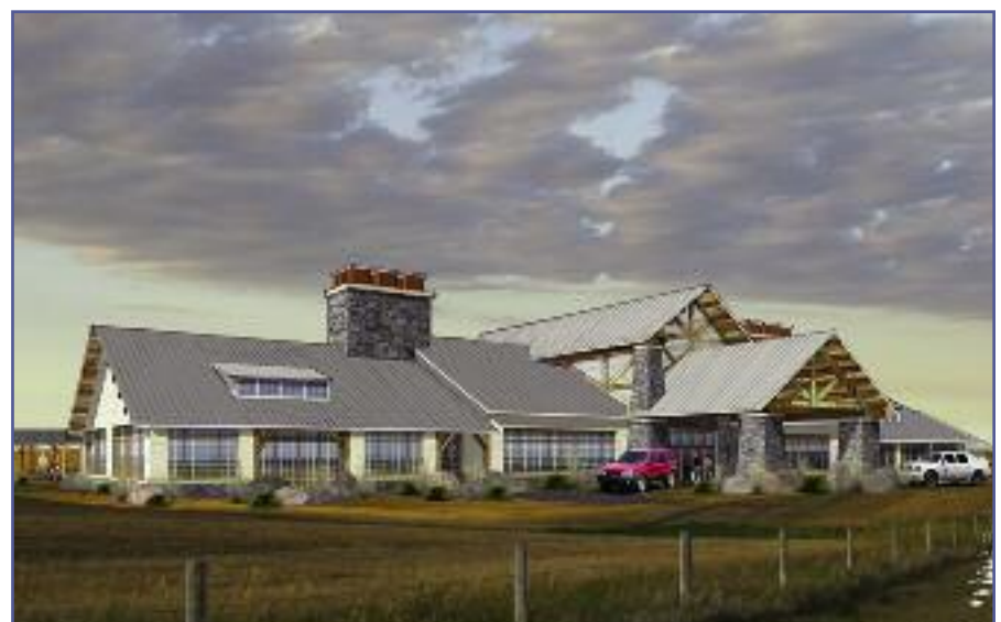
Cannonball Run Hunting Lodge — Rendering: Brackett Zimmermann, LLC