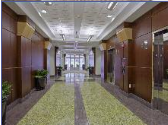
DANAC Building 6 Lobby, Rockville, MD