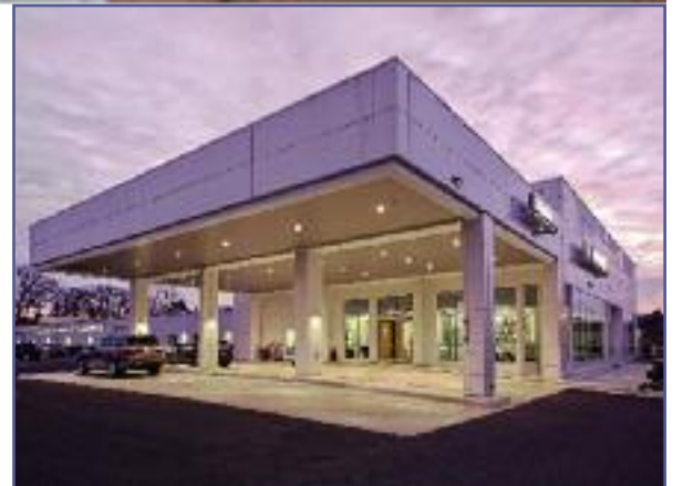
VOB BMW Rockville