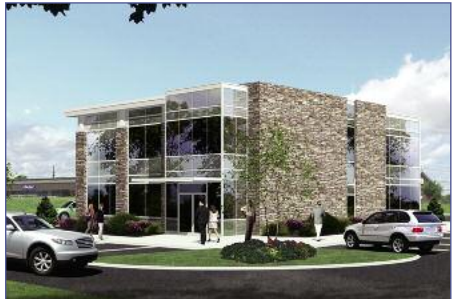
Blue Ridge Medical Center

For more information about Bates Architects, visit them at: www.batesarchitectspc.com