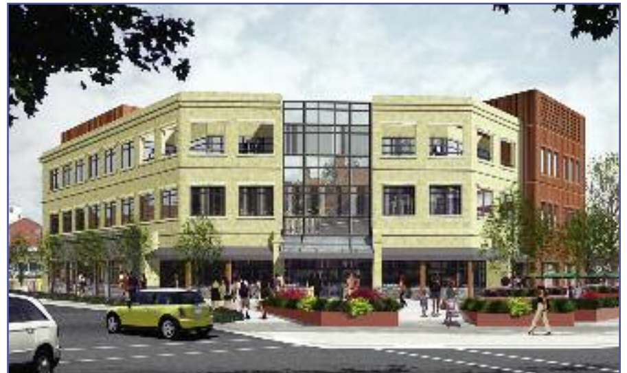
315 E. Diamond, Gaithersburg, MD — Brackett-Zimmerman Rendering

We are proud of our association with Bates Architects!