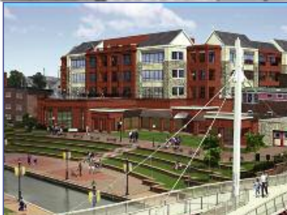
Carrol Creek, Frederick, MD