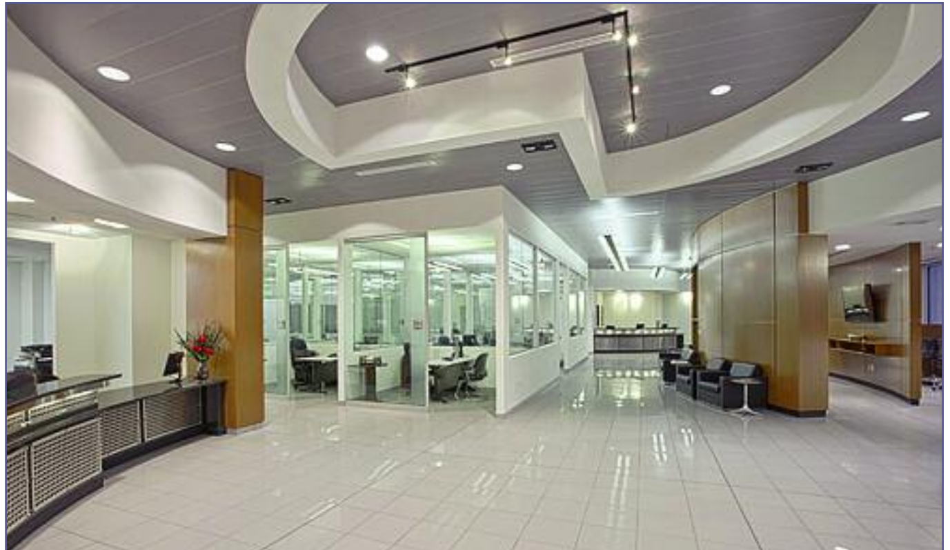
VOB BMW Rockville