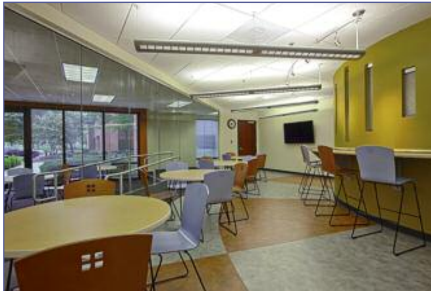
VA Admin Building Cafeteria

Of course what really matters in measuring client satisfaction is what the clients themselves are saying. The following quotes give an impressive example of how Bates Architects have become not just clients, but friends.