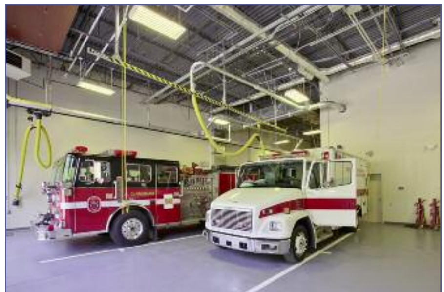
Station 35 Clarksburg

Baltimore - Greater Washington, D.C. - Northern Virginia - 800.899.3633