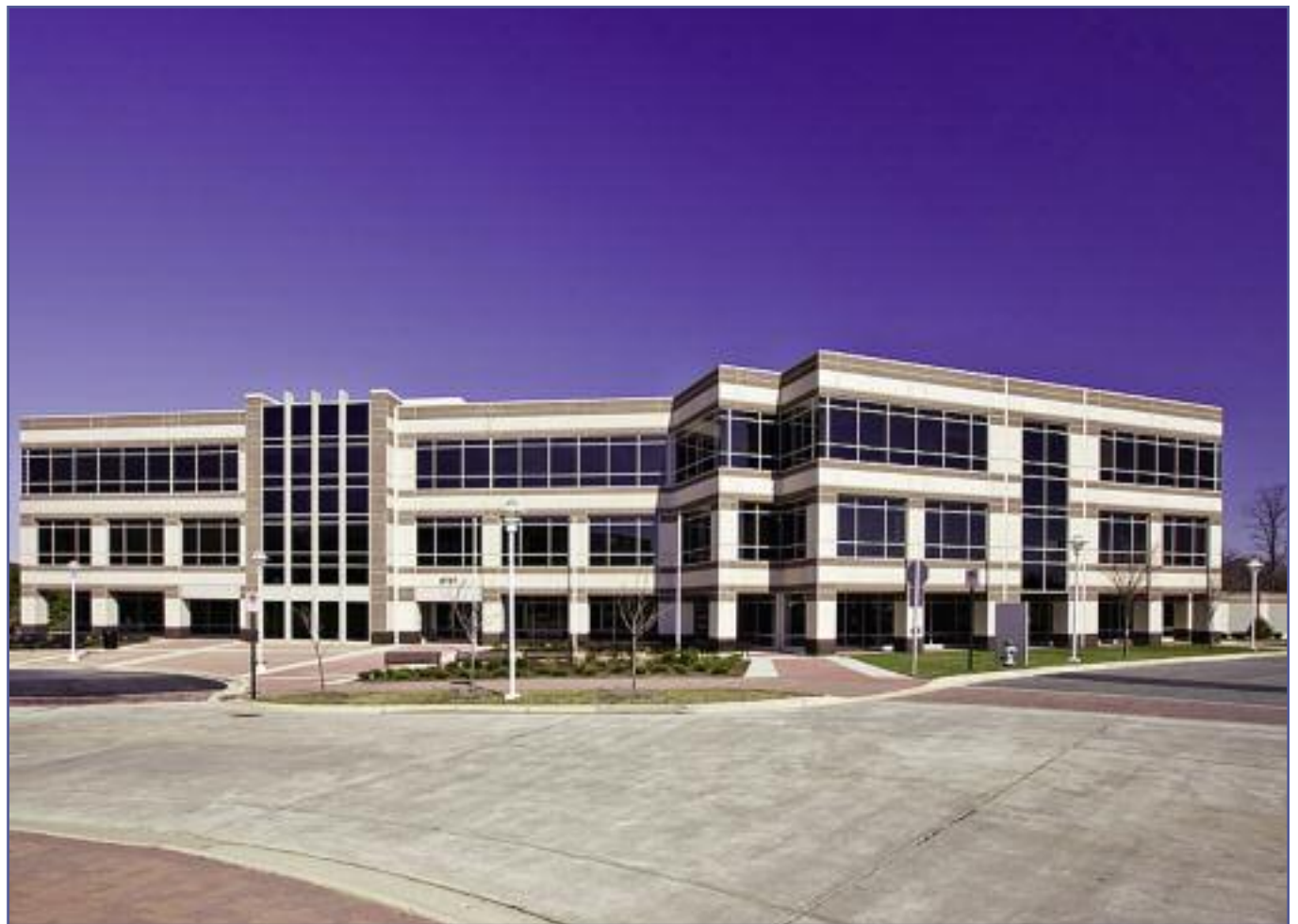
DANAC Building Rockville, MD